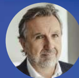
Michał Sołowow, entrepreneur, industrialist, investor